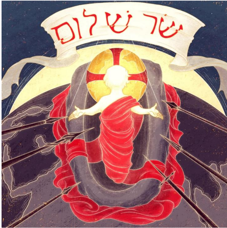
משך שלום means “Prince of Peace”

Isaiah 9:6, ‘For to us a child is born, to us a son is given; and the government shall be upon His shoulder, and His name shall be called...Prince of Peace.’